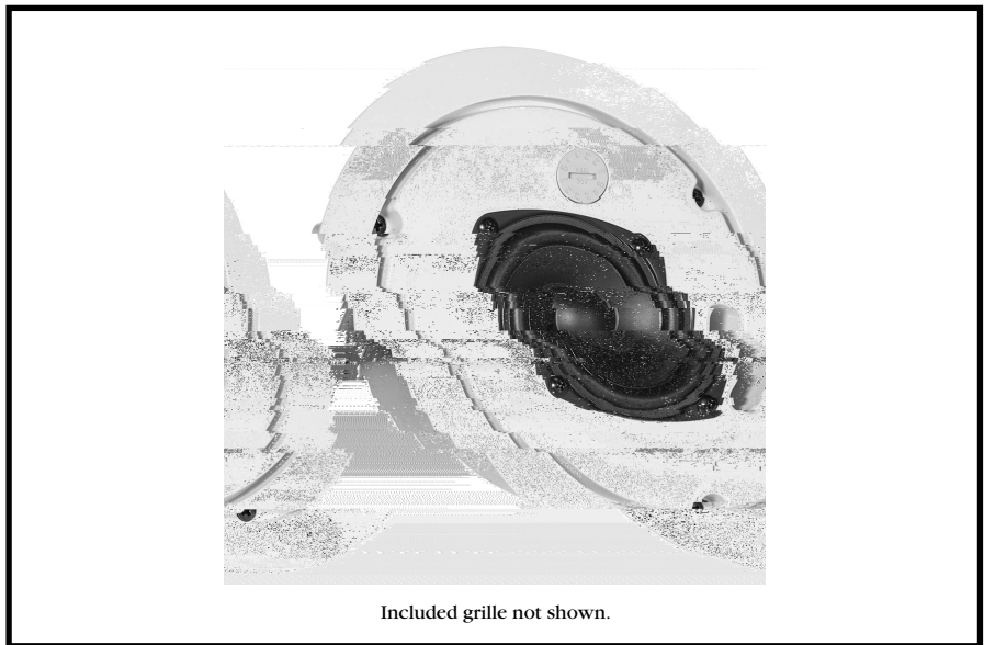
Included grille not shown.

Ideal for a wide variety of projects, the Control 12C/T is switchable for use as either an 8 ohm low-impedance speaker or as part of a 70V or 100V distributed loudspeaker system with a 15 Watt multi-tap transformer. The speaker comes complete with two tile rail supports, one C-ring support backing plate, cutout template, paint shield and grille. A safety seismic attachment ring is provided on the top surface. Available in white or black (-BK).